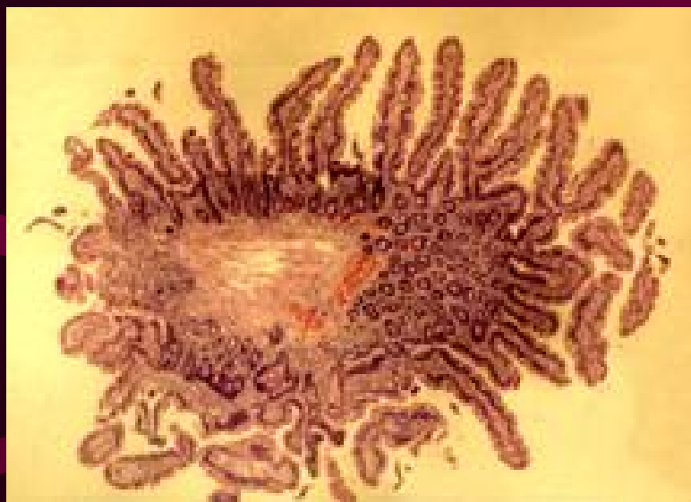
Normal Small Intestinal Biopsy